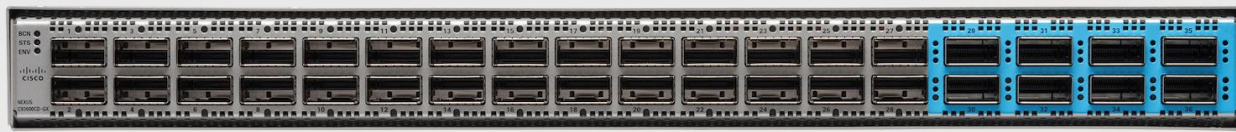
Figure 2. Cisco Nexus 93600CD Switch

The Cisco Nexus 93600CD-GX Switch (Figure 2) is a 1RU switch that supports 12 Tbps of bandwidth and 4.0 bpps across 28 fixed 40/100G QSFP-28 ports and 8 fixed 10/25/40/50/100/200/400G QSFP-DD ports. The 28 ports support 10/25-Gbps. Please see feature table below for more information.