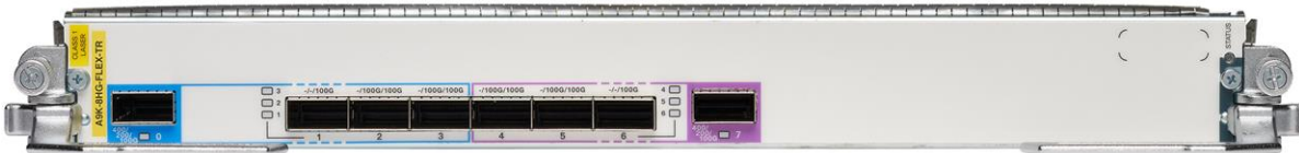
Figure 4. Cisco ASR 9000 Series 800G Packet Transport Combo Line Card - 5 th Generation - TR