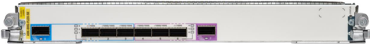
Figure 3. Cisco ASR 9000 Series 800G Service Edge Combo Line Card - 5 th Generation - SE