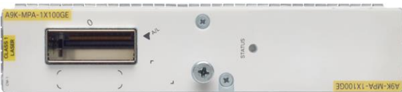
Figure 4. Cisco ASR 9000 Series 1-port 100G modular port adapter