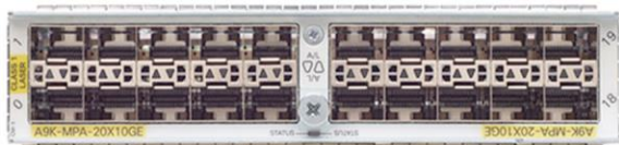
Figure 2. Cisco ASR 9000 Series 20-port 10G modular port adapter