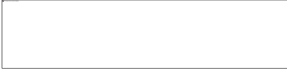
Figure 5. Cisco ASR 9000 Series 1-port 200G modular port adapter