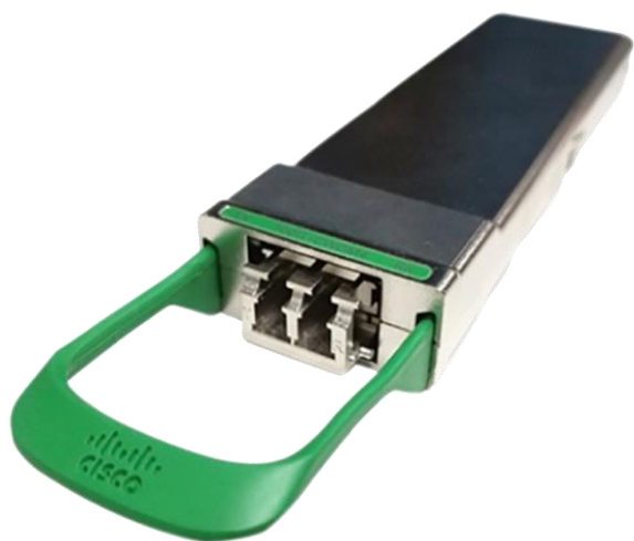
Figure 9. Cisco CPAK-100G-CWDM4 Module

The Cisco CPAK-100G-CWDM4 Module supports link lengths of up to 2 km over a standard pair of G.652 Single-Mode Fiber (SMF) with duplex LC connectors. The 100 Gigabit Ethernet signal is carried over four wavelengths. Multiplexing and demultiplexing of the four wavelengths are managed within the device.