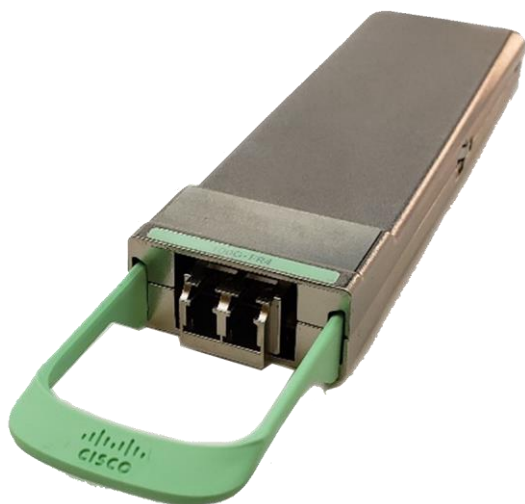
Figure 11. Cisco CPAK-100G-FR Module

The Cisco CPAK-100G-FR Module supports link lengths of up to 2 km over a standard pair of G.652 Single-Mode Fiber (SMF) with duplex LC connectors. The 100 Gigabit Ethernet optical signal is carried over a single wavelength using a PAM4 (Pulse-Amplitude Modulation 4-Level) modulation scheme.