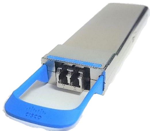
Figure 2. Cisco CPAK-100GE-LR4 Module with LC Connectors