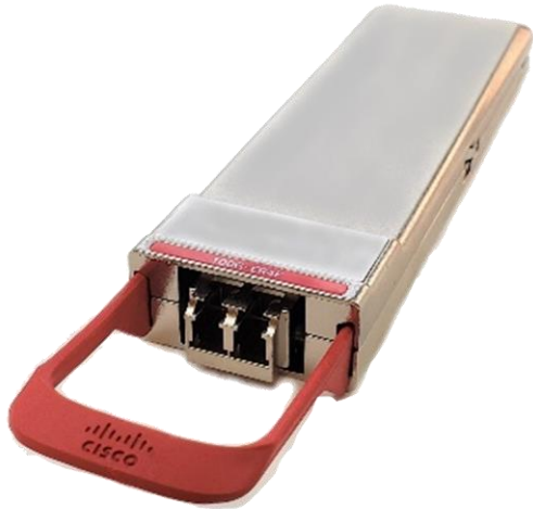
Figure 4. Cisco CPAK-100G-ER4F Module with LC connectors