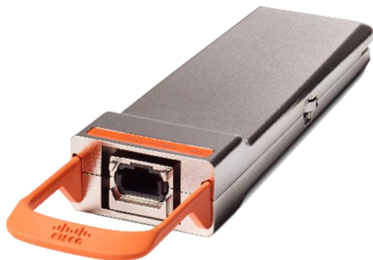
Figure 10. Cisco CPAK-100G-PSM4 Module

The Cisco CPAK-100G-PSM4 Module supports link lengths of up to 500 meters over Single-Mode Fiber (SMF) with MPO connectors. The 100 Gigabit Ethernet signal is carried over 12-fiber parallel fiber terminated with MPO multifiber connectors.