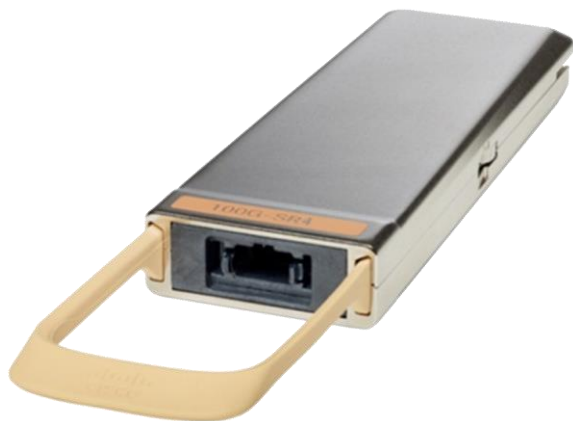
Figure 8. Cisco CPAK-100G-SR4 Module

The Cisco CPAK-100G-SR4 Module supports link lengths of up to 70m (100m) over OM3 (OM4) Multimode Fiber with MPO connectors. It primarily enables high-bandwidth 100G optical links over 12-fiber parallel fiber terminated with MPO multifiber connectors. CPAK-100GE-SR4 supports 100GBase Ethernet rate.