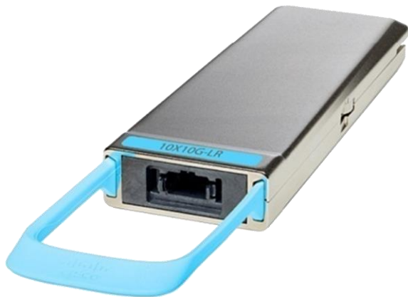
Figure 5. Cisco CPAK-10X10G-LR Module

The Cisco CPAK-10X10G-LR module is used in 10 x 10Gb mode along with ribbon-to-duplex SMF breakout cables for connectivity to ten 10GBASE-LR optical interfaces. It supports link lengths up to 10km over standard SMF, G.652. The module delivers 100-Gbps links over 24-fiber ribbon cables terminated with MPO/MTP connectors.