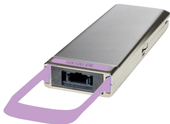
Figure 7. Cisco CPAK-10X10G-ERL Module

The Cisco CPAK-10X10G-ERL module is used in 10 x 10Gb mode along with ribbon-to-duplex SMF breakout cables for connectivity to ten 10GBASE-ER optical interfaces. It supports link lengths up to 25km over standard SMF, G.652. The module delivers 100Gbps links over 24-fiber ribbon cables terminated with MPO/MTP connectors.