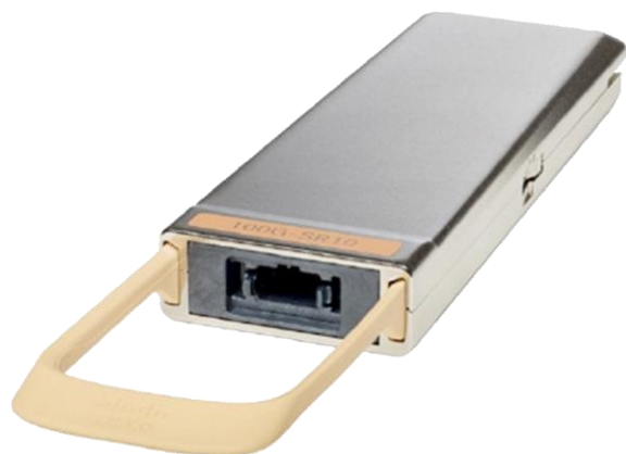
Figure 6. Cisco CPAK-100G-SR10 Module

The Cisco CPAK-100G-SR10 module delivers 100-Gbps links over 24-fiber ribbon cables terminated with MPO/MTP connectors. It can also be used in 10 x 10Gb mode along with ribbon-to-duplex-fiber breakout cables for connectivity to ten 10GBASE-SR optical interfaces. It supports link lengths of 100m and 150m on laser-optimized OM3 and OM4 multifiber cables, respectively.