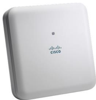
Figure 1. Cisco Aironet 1830 Series