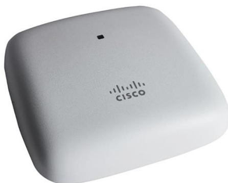
Figure 1. Cisco Aironet 1815i Access Point

The 1815i extends support to a new generation of Wi-Fi clients, such as smartphones, tablets, and high-performance laptops that have integrated 802.11ac Wave 1 or Wave 2 support.