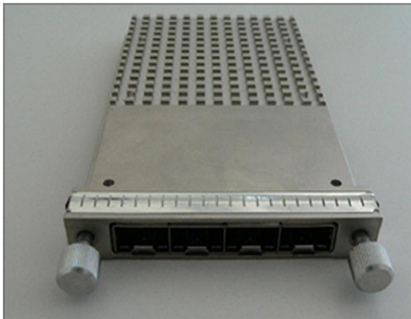
Figure 3. Cisco FourX Converter Module

The Cisco FourX converter module (Figure 3) offers the flexibility to convert a 40 Gigabit Ethernet CFP port of a Cisco switch or router into four independent 10 Gigabit Ethernet ports supporting Cisco 10GBASE Small Form Factor Pluggable Plus (SFP+) modules. The 10 Gigabit Ethernet SFP+ modules are not included.