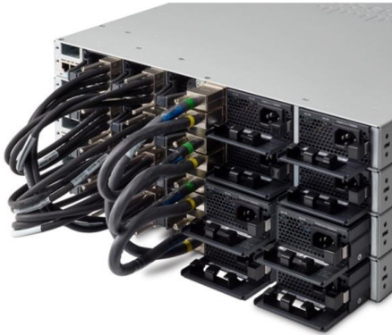
Figure 7. Cisco Catalyst 9300 Series StackPower