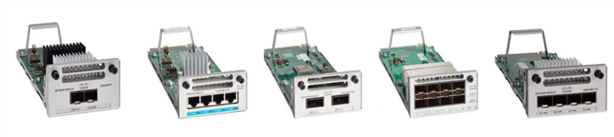
Figure 3. Cisco Catalyst 9300 Series Network Modules