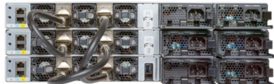
Figure 6. Cisco Catalyst 9300 Series fixed uplink models with optional stack kit