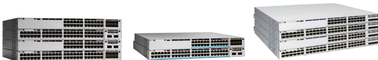
Figure 1. Cisco Catalyst 9300 Series switches

The Cisco Catalyst 9300 Series is made up of nineteen modular uplink switch models and fourteen fixed uplink switch models.