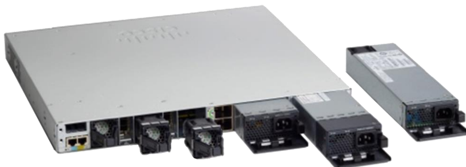
Figure 4. Cisco Catalyst 9300 Series Dual Redundant power supplies

Cisco Catalyst 9300 Series switches support dual redundant power supplies. The switches ship with one power supply by default, and the second power supply can be purchased when the switch is ordered or at a later time. If only one power supply is installed, it should always be in power supply bay #1. The switches also ship with three field-replaceable fans. Power Supplies are common across the Catalyst 9300 Series.