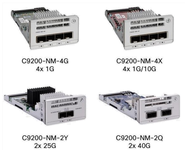
Figure 2. Cisco Catalyst 9200 Series Switch network modules

Cisco Catalyst 9200 Series switches come with modular or fixed uplinks as indicated in Table 1. With modular SKUs, the field-replaceable network modules provide infrastructure investment protection by allowing a nondisruptive migration from 1G to 10G and beyond. When you purchase the switch, you can choose from the network modules described in Table 3.