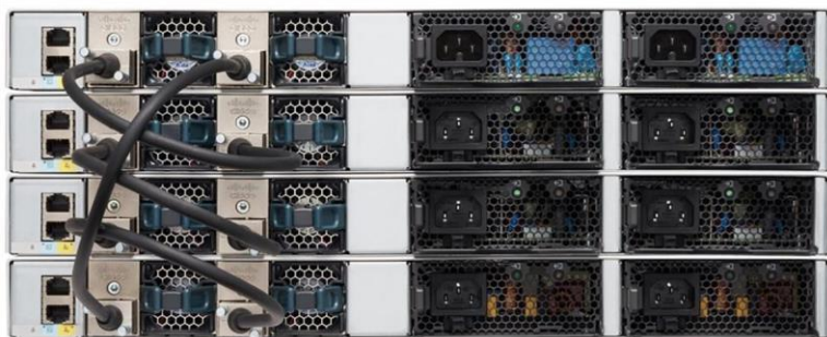
Figure 4. Cisco Catalyst 9200 Series Switch stacked units