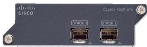
Figure 7. Cisco FlexStack-Extended: Fiber module