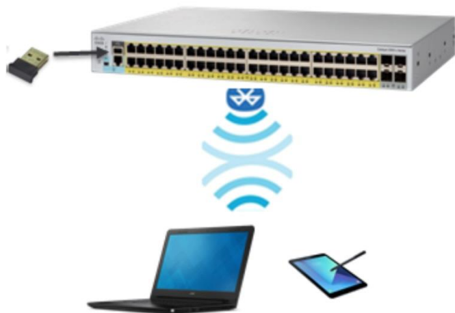
Figure 4. Over-the-air switch access using Bluetooth