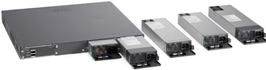
Figure 2. Cisco Catalyst 2960-XR Series power supply

Dual redundant power supplies are supported on the Cisco Catalyst 2960-XR Series Switches. These switches ship with one power supply by default. The second power supply can be purchased at the time of ordering the switch or as a spare. These power supplies have built-in fans to provide cooling (Figure 2).