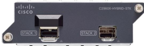
Figure 6. Cisco FlexStack-Extended: Hybrid module