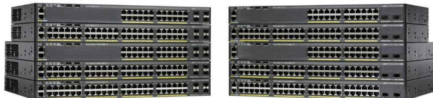
Figure 1. Cisco Catalyst 2960-X Series Switches

Cisco® Catalyst® 2960-X and 2960-XR Series Switches are fixed-configuration, stackable Gigabit Ethernet switches that provide enterprise-class access for campus and branch applications (Figure 1). They operate on Cisco IOS® Software and support simple device management as well as network management. The Cisco Catalyst 2960-X and 2960-XR Series provide easy device onboarding, configuration, monitoring, and troubleshooting. These fully managed switches can provide advanced Layer 2 and Layer 3 features as well as optional Power over Ethernet Plus (PoE+) power. Designed for operational simplicity to lower total cost of ownership, they enable scalable, secure, and energy-efficient business operations with intelligent services. The switches deliver enhanced application visibility, network reliability, and network resiliency.