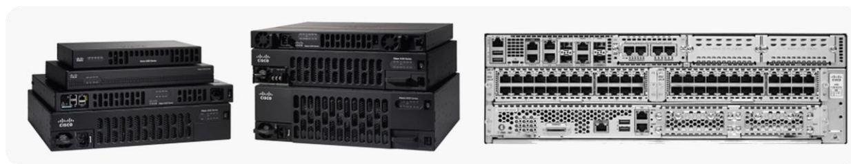
Figure 1. Cisco 4000 Series Integrated Services Routers

The Cisco 4000 Family contains the following platforms: the 4461, 4451, 4431, 4351, 4331, 4321 and 4221 ISRs.